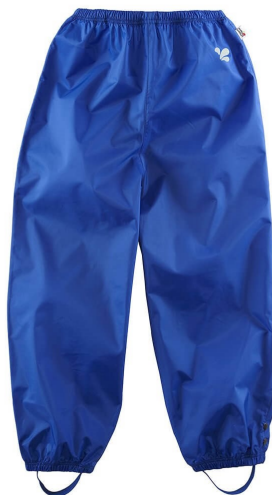
Any colour waterproof trousers