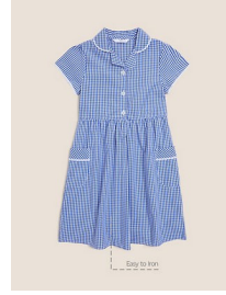
Blue checked dress